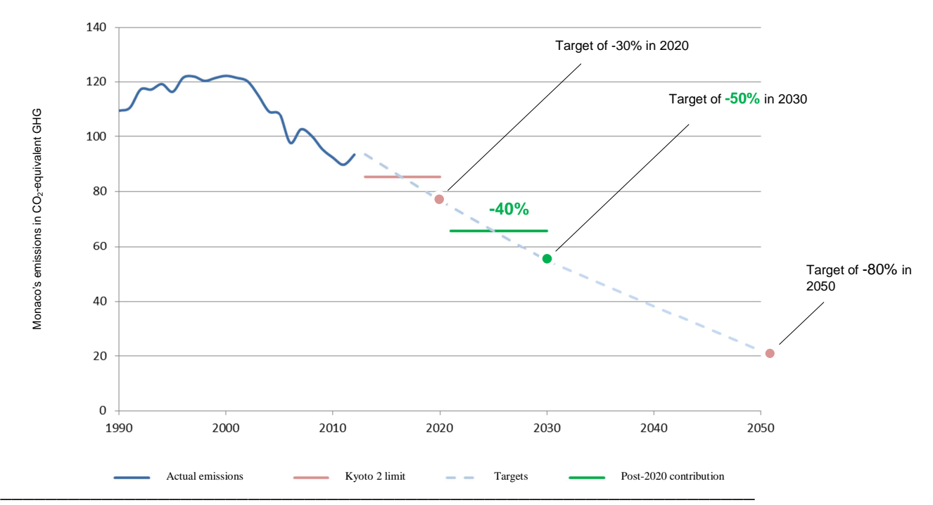
Figure 1: Graph showing the Principality of Monaco's reduction target assuming a commitment period of 10 years